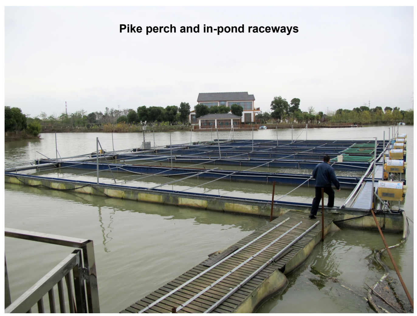
In pond raceway system producing largemouth bass. Current through the system is generated by air lift, with the blowers visible on the right side streaming air across angled plates.

During our visit to China for the FAO-NACA workshop on classification of aquaculture farming systems (see cover article), we were fortunate to visit two innovative farms in the Wuxi area