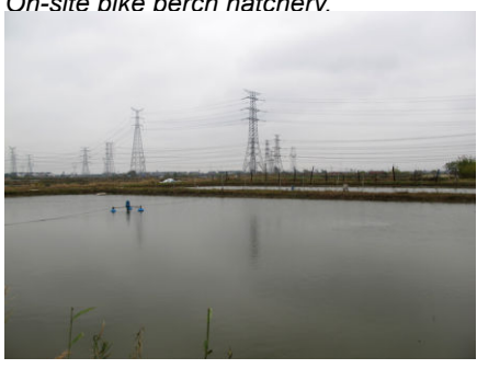
Grow out ponds are 4.5 metres deep to stabilise water temperature.