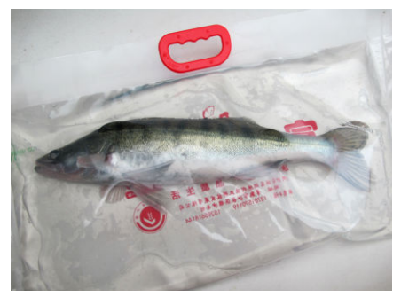
European pike perch in an inflatable carry case to allow anglers to take their catch home live.

Both farms featured real-time water quality and video monitoring systems. Probes in each pond, and in the rear of the raceway system, measure water quality. The data is broadcast live to a base station in the main office and displayed on a screen in view of the manager's desk. Staff can access the real time data on their mobile phones. The system logs the data and can broadcast warnings to staff if a problem arises.