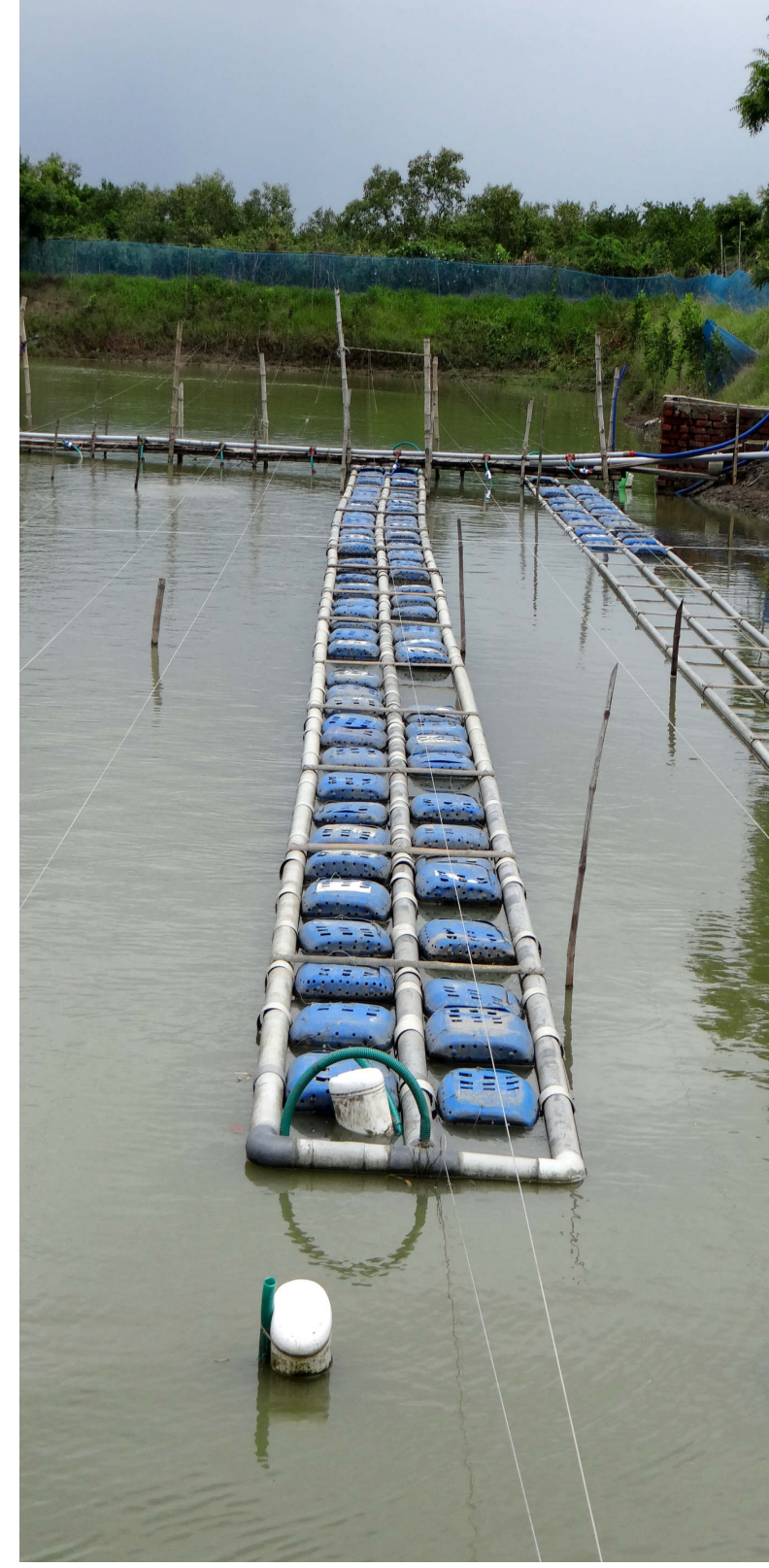
A single farm-made submersible cage.