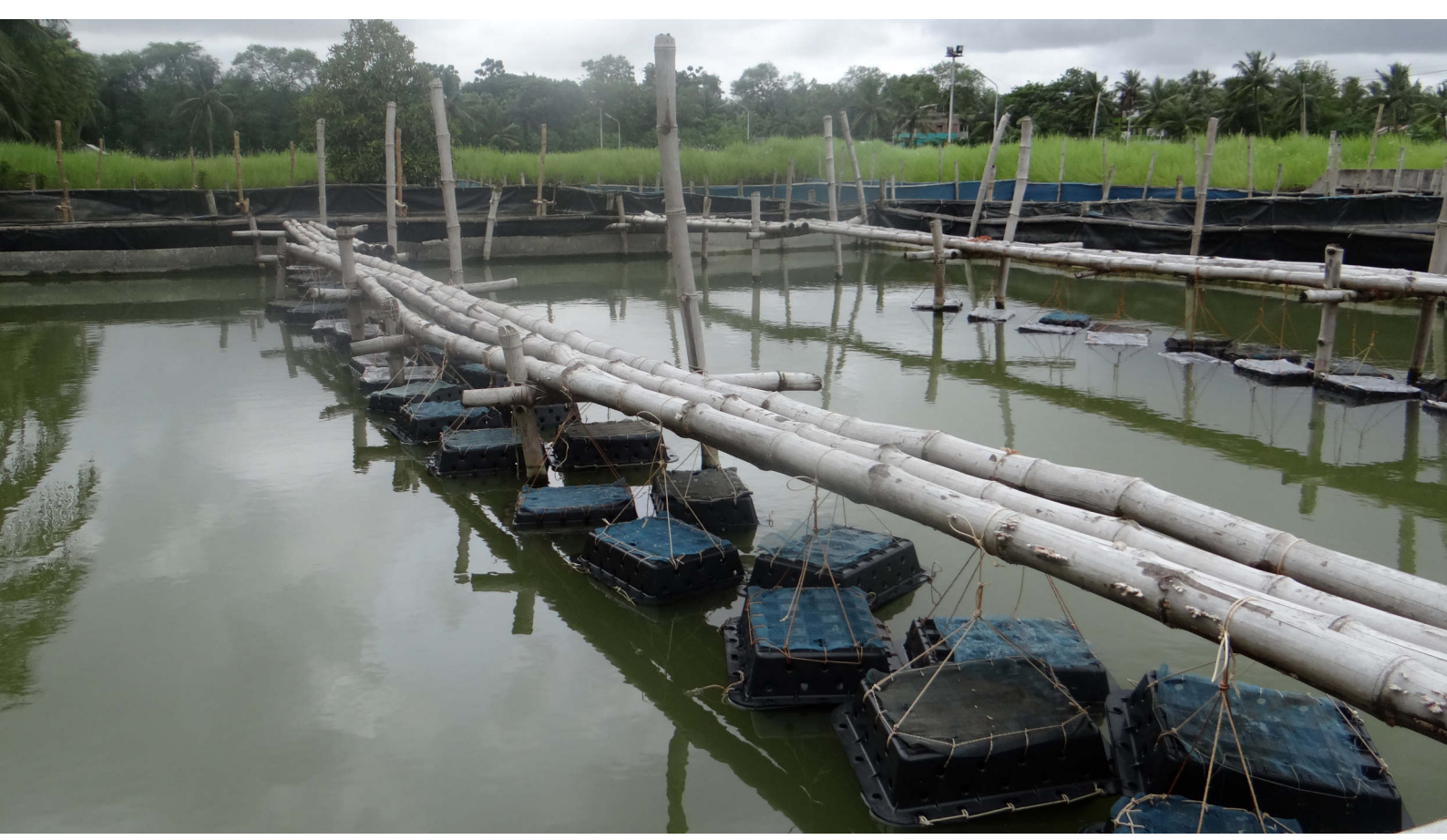
Above, below: Rafts for box culture of mud crab.