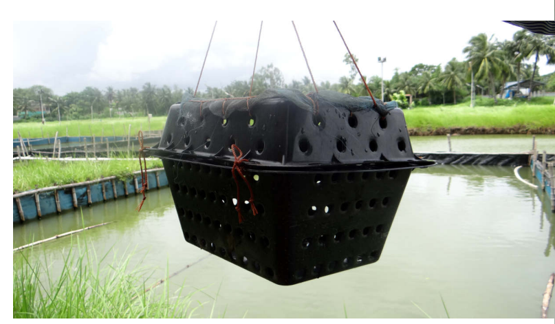
Above, below: Box culture of mud crab.

Another emerging technology that has entered the market in recent years is the vertical RAS which is designed principally for indoor environments. This system incorporates a sand-filter, bio-filters and U.V. filters, which are all interconnected with a specially designed and vertically stacked mud crab box. Although it is a sophisticated system with the ability to control water quality requirements and facilitate observation of the culture crabs, it may not be suitable for farmers of low means due to its high initial investment. On the other hand,