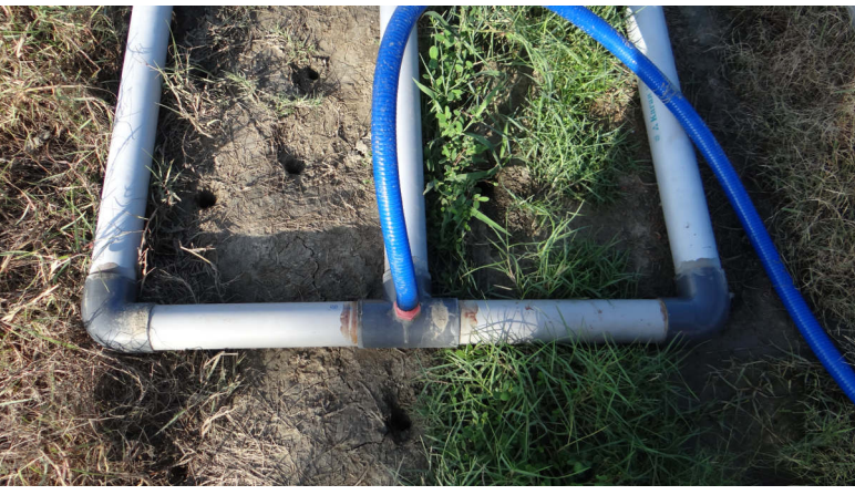
Interconnecting pipes for support and floatation of box cages.

vertically stacked mud crab boxes which can be installed in pond system with a lifting and sinking mechanism can be an innovative and less expensive alternative for farmers.