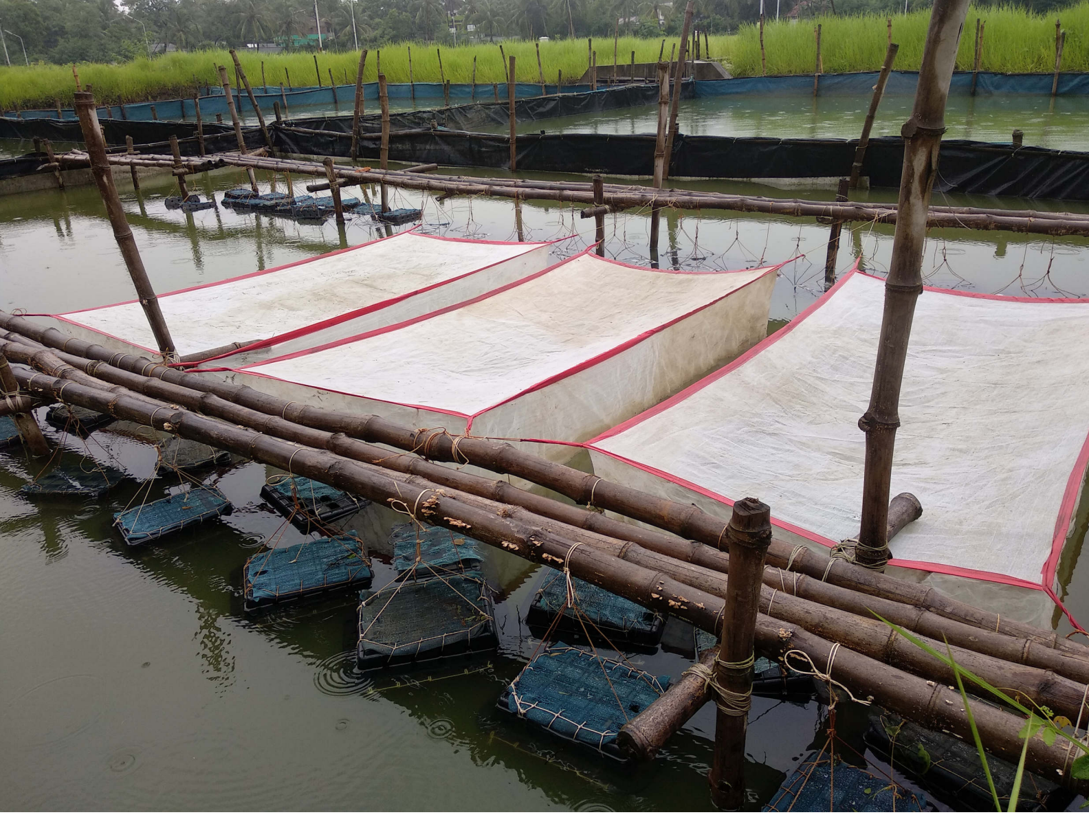
Hapa nurseries for rearing of mud crab instar.

designed feeding tray that leaves a space between the bottom soil and tray while submerged is employed to avoid crushing of crablets present in the bottom sand while lowering the tray. The animals are fed with chopped molluscan meat ad libitum twice daily. To provide shelter and to avoid cannibalism, a large number of hides made of pipes and tiles are provided. Grading and culling of animals are carried out by carefully picking up the hideout pipes and collecting shooters of 80-100 g among the smaller size crabs (10-40 g) which were then stocked to grow-out ponds. Final harvest after completion of second tier is carried out after 45 days with an average harvest size of 80g (40-120 g) and average survival of 50%.