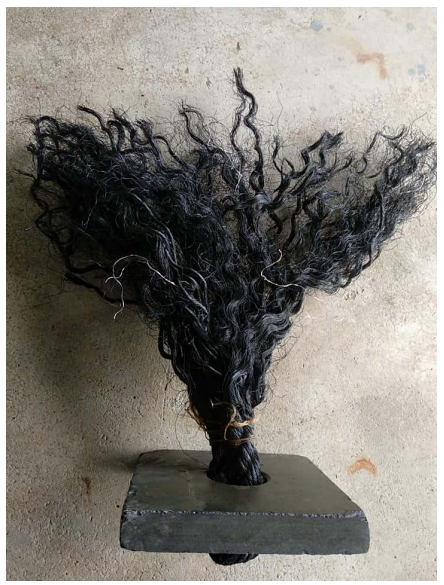
Crab hide used in nursery.