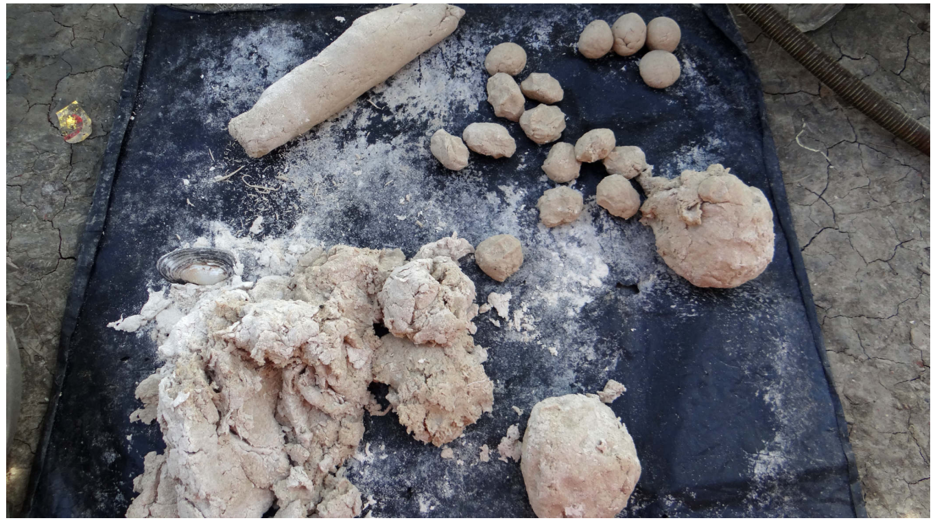
Farm made pellet feed.

The harvested crablets of 2.5-4 cm from hapas are stocked into nursery ponds at the rate of 3-4 individuals/m<sup>2</sup>. Pond preparation includes crab fencing, disinfection, liming and fertilisation using minerals and probiotics. A specially