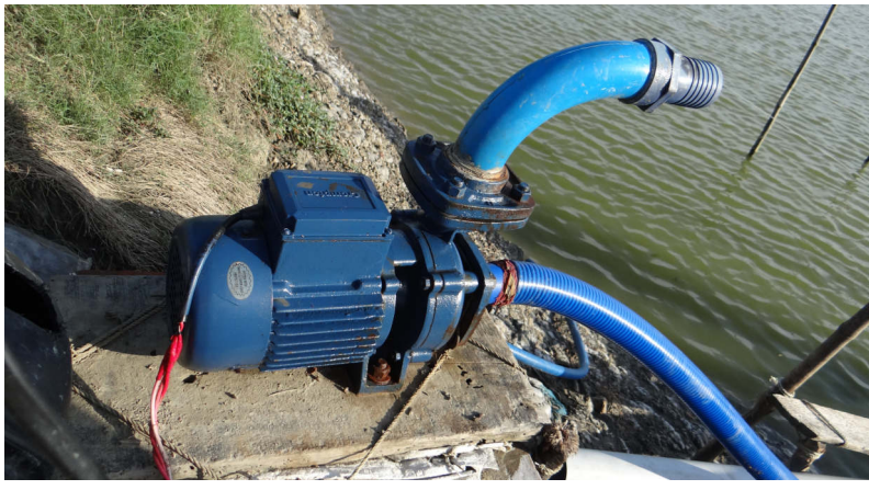
1.5 HP pump for suction and delivery of water into the box cage pipe, controlling flotation and submersion.