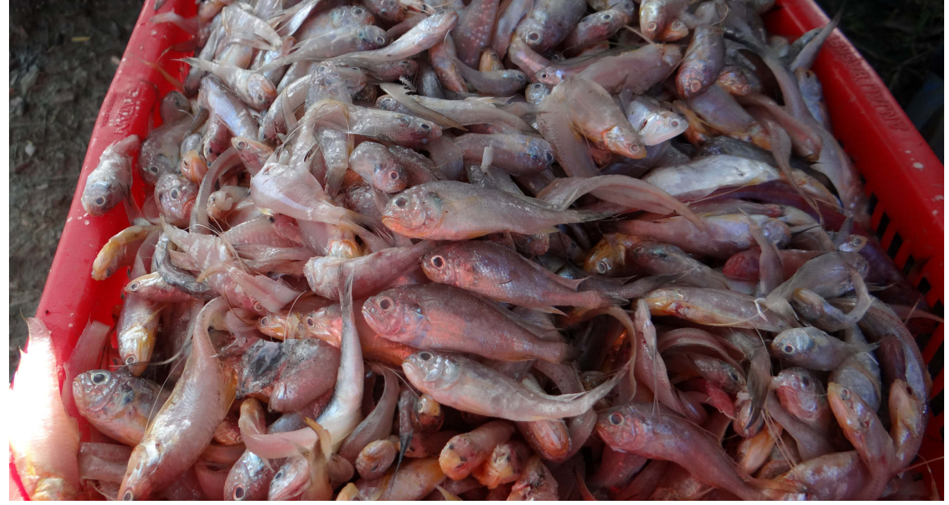
Above, below: Trash fish (raw and sun-dried).