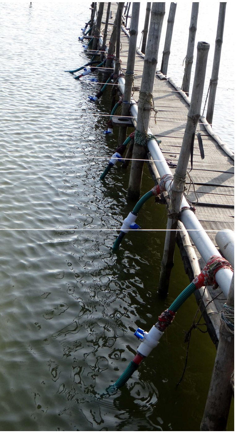
Several units are interconnected using the main pipe from the pump.