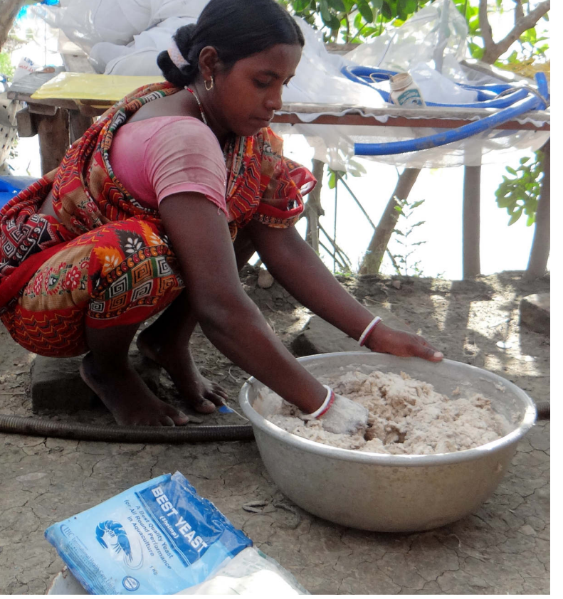
Preparation of farm-made mud crab feed.

bream ( Nemipterus sp.) and grenadier anchovies ( Coila sp.) are among the commonly available trash fish in West Bengal. Molluscan species such as Telescopium sp. and Bellamya bengalensis which are available in ponds and canals as pests are often caught and utilised as feed in nursery rearing of mud crab. The ease of farming and lower investment required in crab culture along with good return attracts small farmers to this venture.