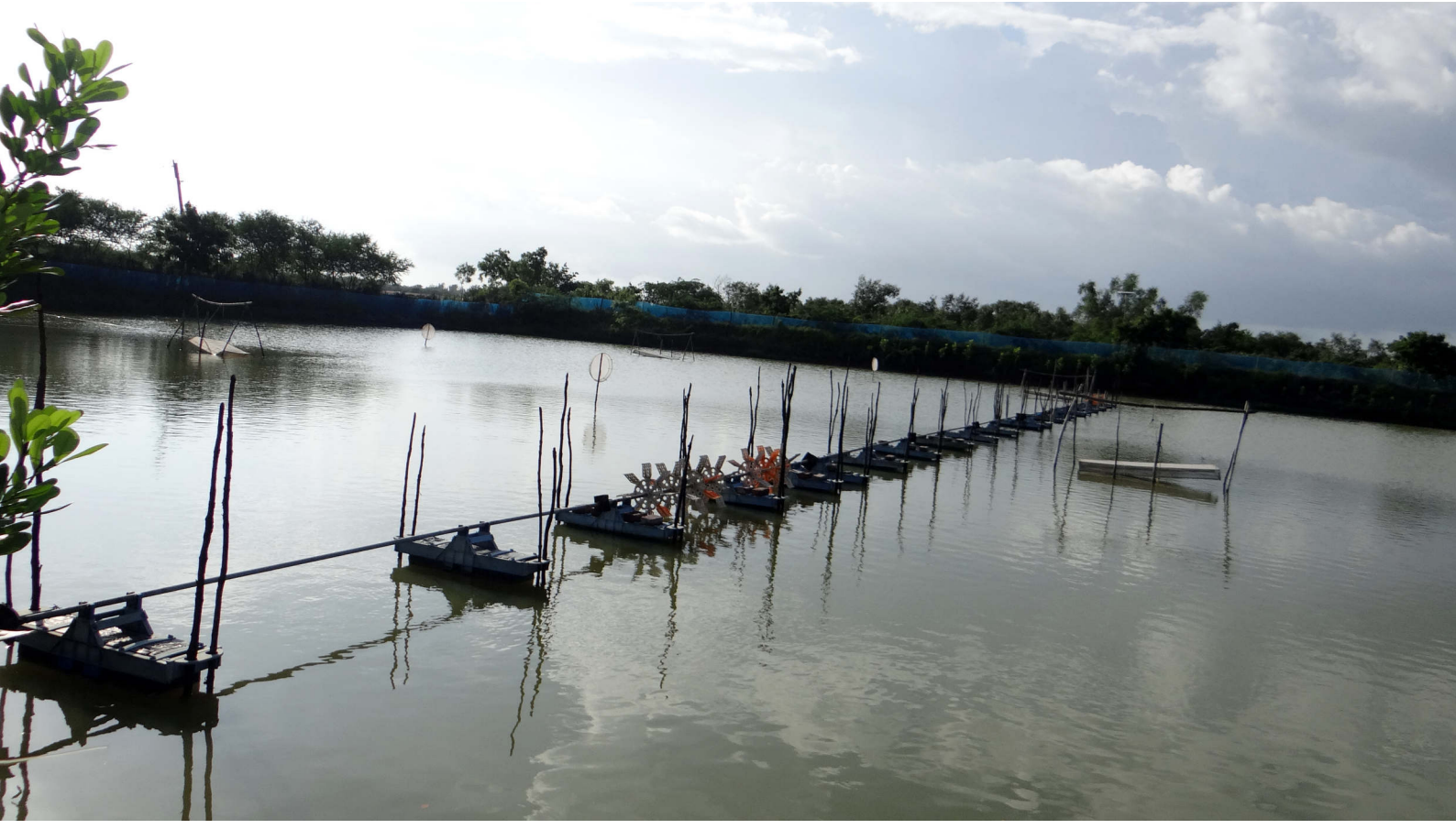
Mud crab grow-out pond.

1. Kakdwip Research Centre, Central Institute of Brackishwater Aquaculture (ICAR), Kakdwip, South 24 Parganas, West Bengal PIN-743 347, India. 2. Central Institute of Brackishwater Aquaculture (ICAR), 75, Santhome High Road, R.A. Puram, Chennai 600 028, India. *Email: christinapautu@yahoo.com