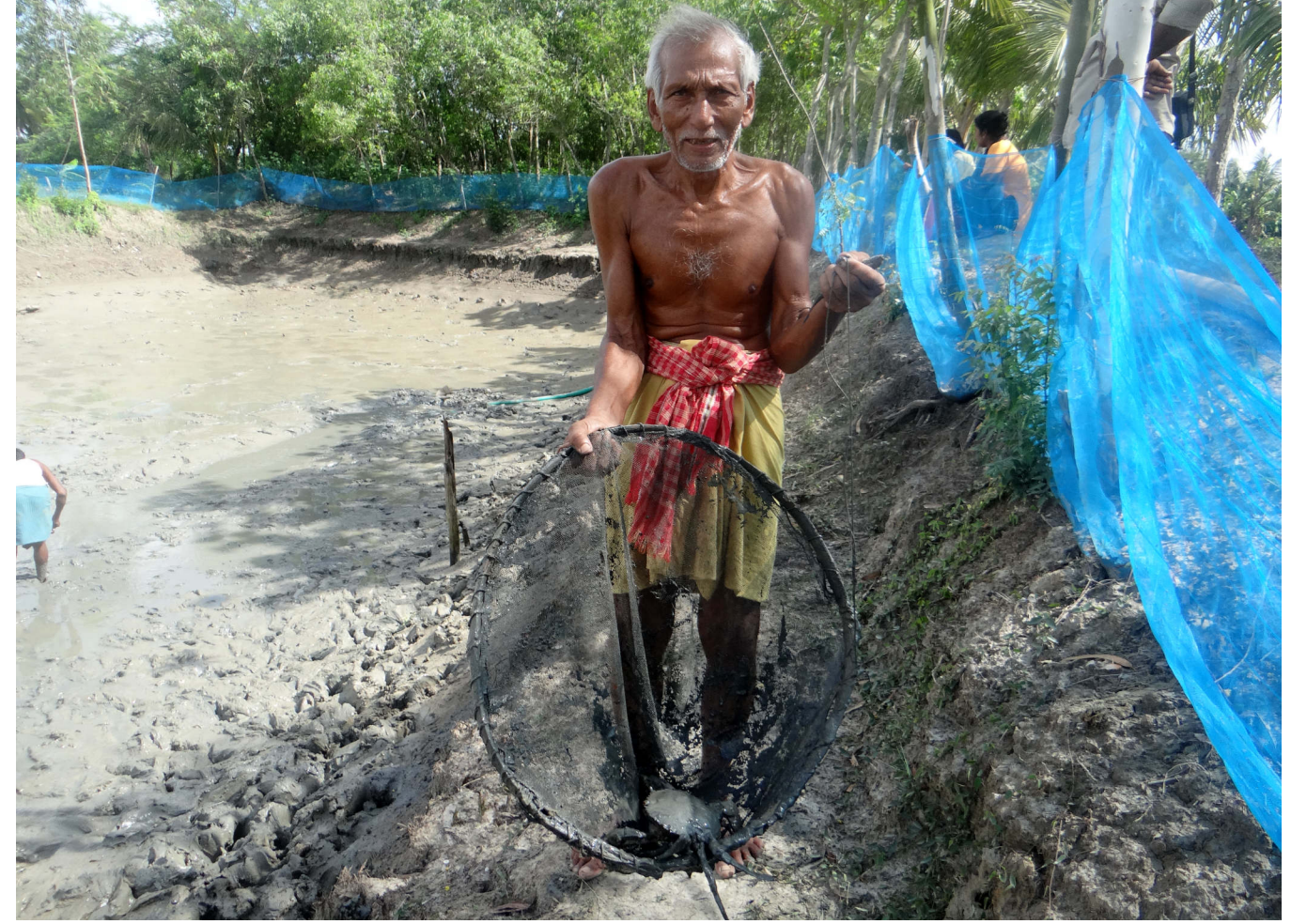
Mud crab harvest using farm-made circular net.