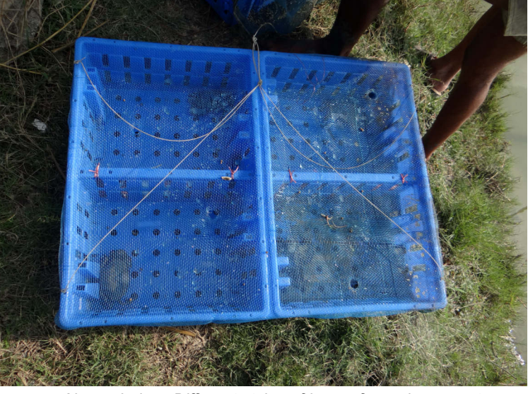
Above, below: Different styles of boxes for crab growout.