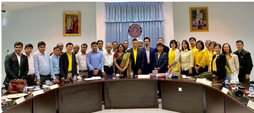
Bangladesh Shrimp and Fish Foundation study tour participants visit the Thai Department of Fisheries.