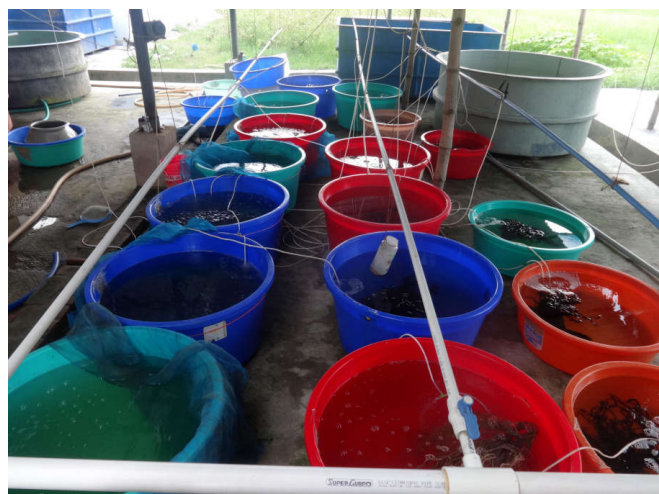
Homestead modular hatchery breeding unit for Mystus gulio .

One day before larval rearing begins, larval rearing tanks are filled with clean water and aerated. To avoid mortality and stress, the newly hatched larvae are gently transferred to larval rearing units as soon as possible. The newly hatched larvae start feeding two days post hatching, before the yolk sack is fully exhausted, which occurs on day three. Larvae