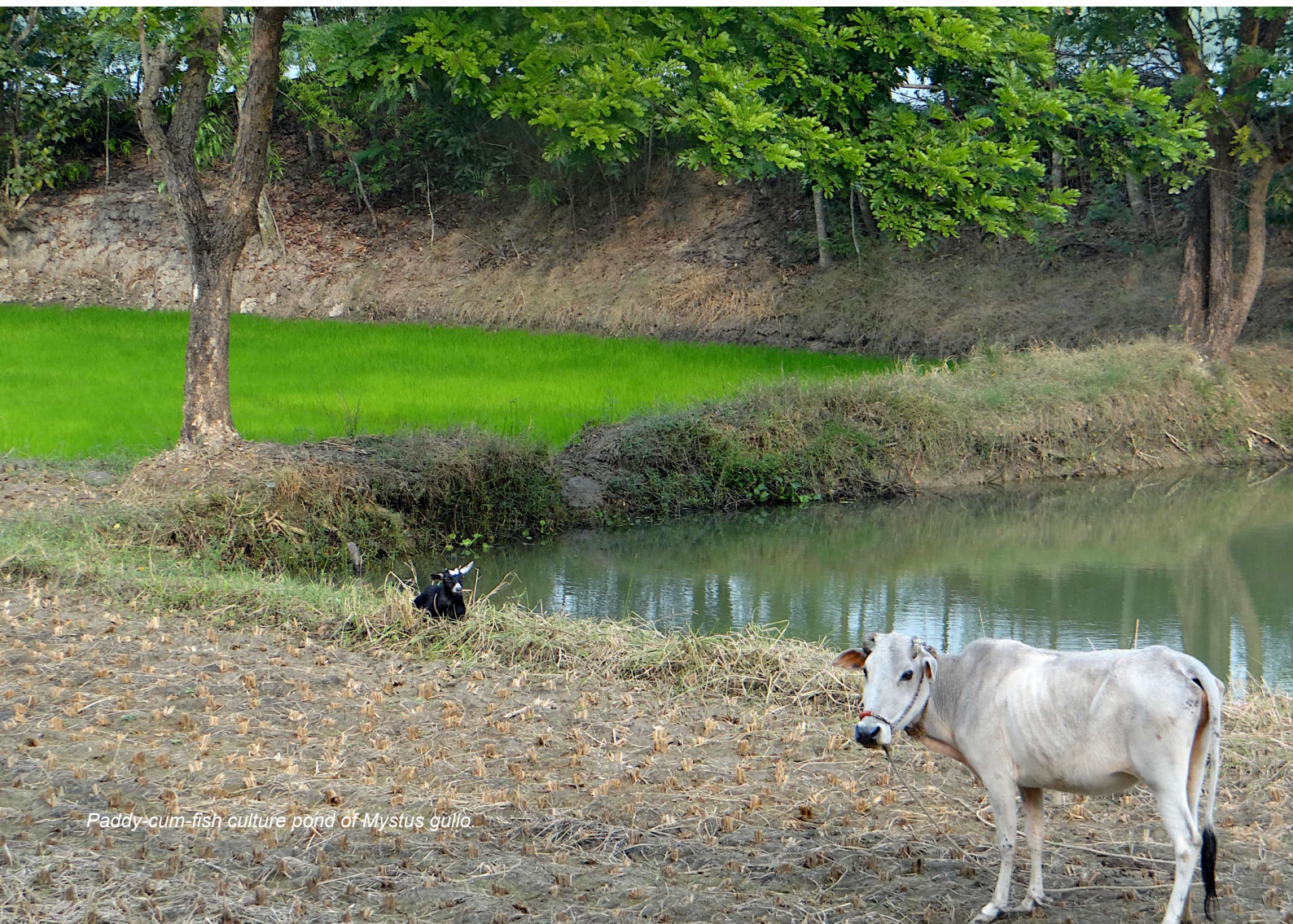
Paddy-cum-fish culture pond of Mystus gulis