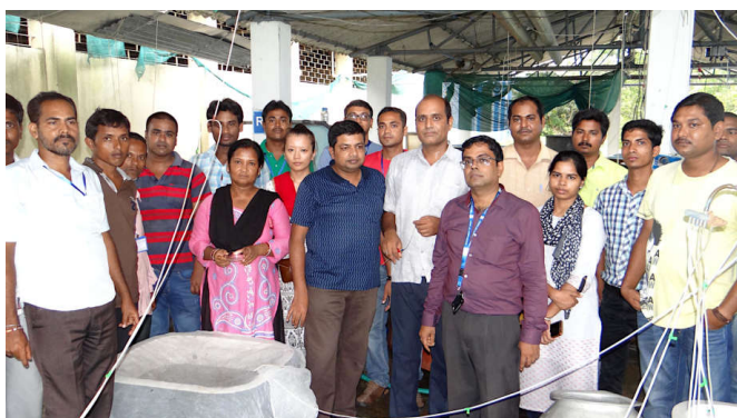
Trainees and faculties in Mystus gulio hatchery yard.