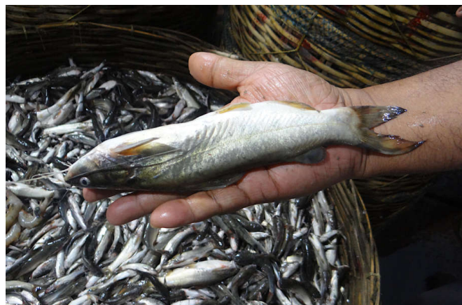
Marketable size of Mystus gulio in West Bengal.