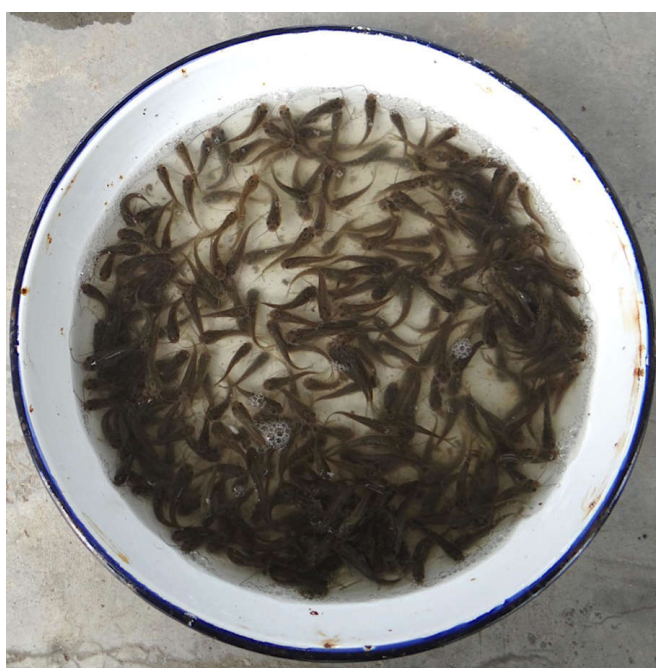
Mystus gulio fry after nursery rearing.

Nursery rearing is essential to produce stockable sized seed for farming. Larval nursery is carried out either in net cage hapa, tanks or small ponds. Nursery rearing in hapa is easy to monitor and economical, and rearing for 60 days in hapa is a suitable system to produce fry for stocking. To carry out