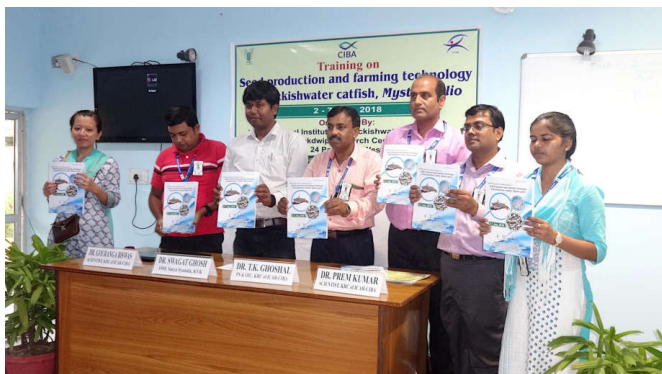
Release of reading materials on Mystus gulio seed production and farming technology.