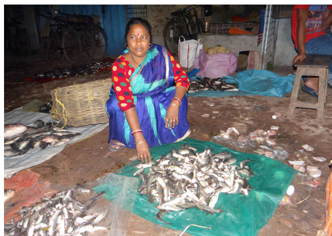
Marketing of Mystus gulio in Namkhana, West Bengal.