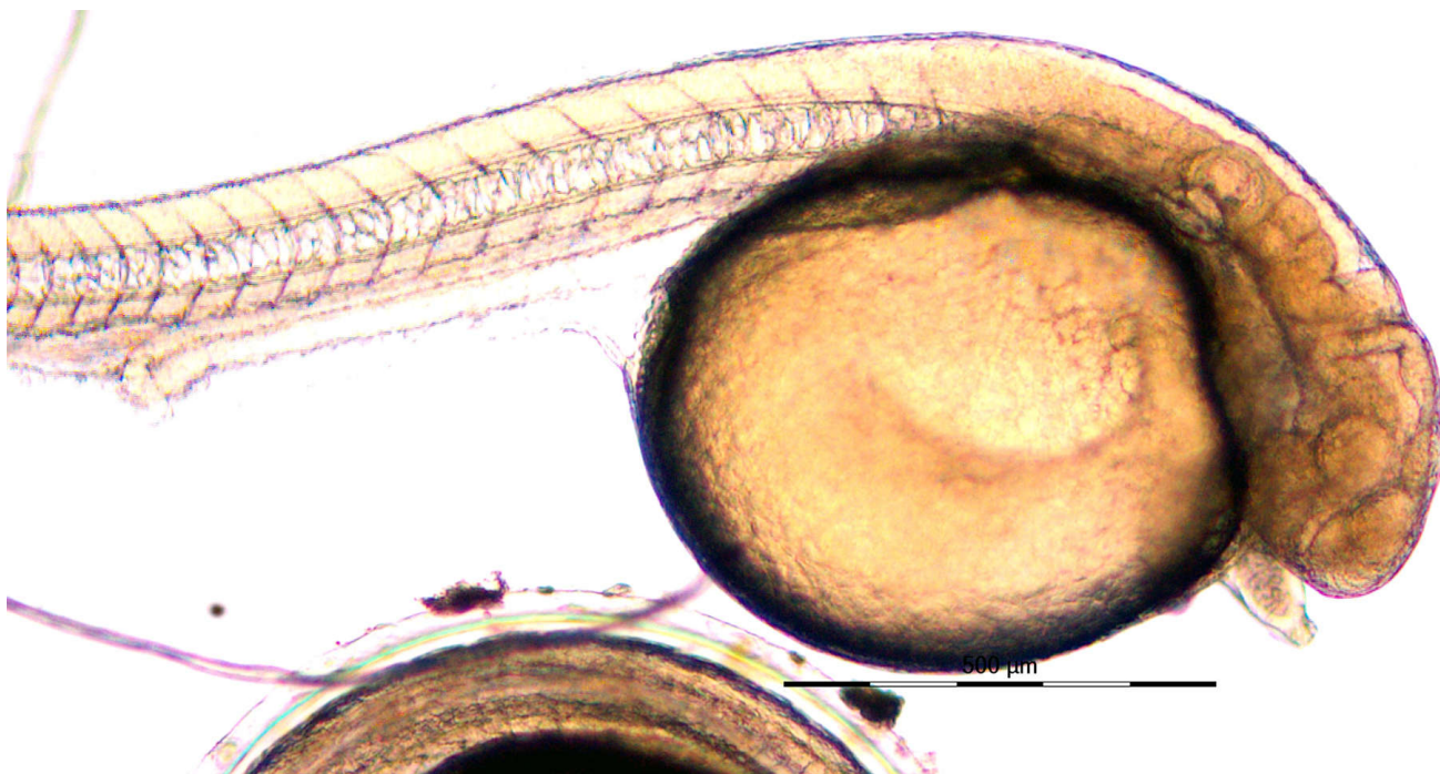
Newly hatched Mystus gulio larvae.