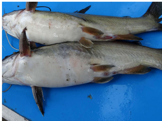
Mystus gulio male (top) and female (bottom) with elongated genital papillae and round vent, respectively.