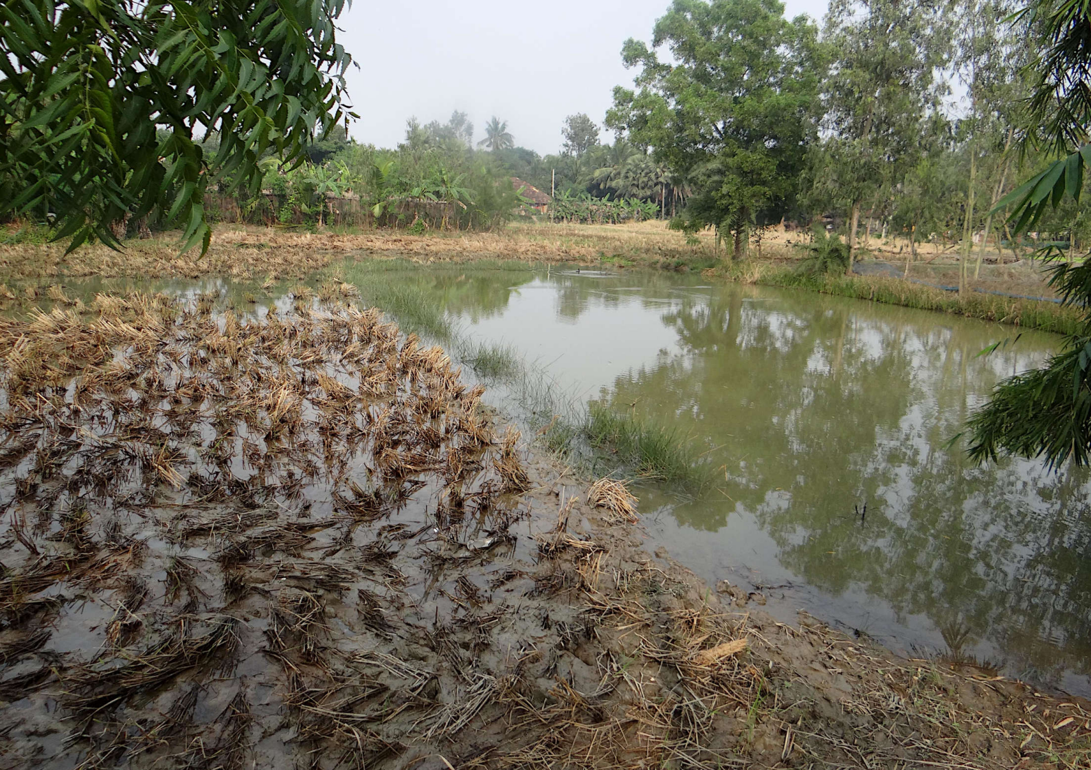
Paddy cum fish culture of Mystus gulio .