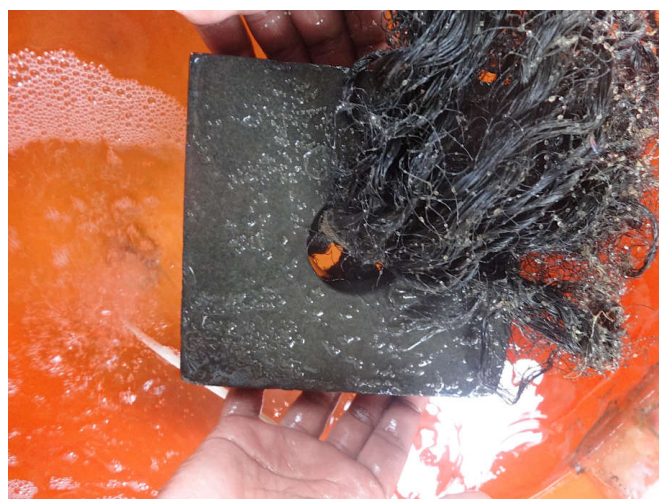
Egg collector with eggs.