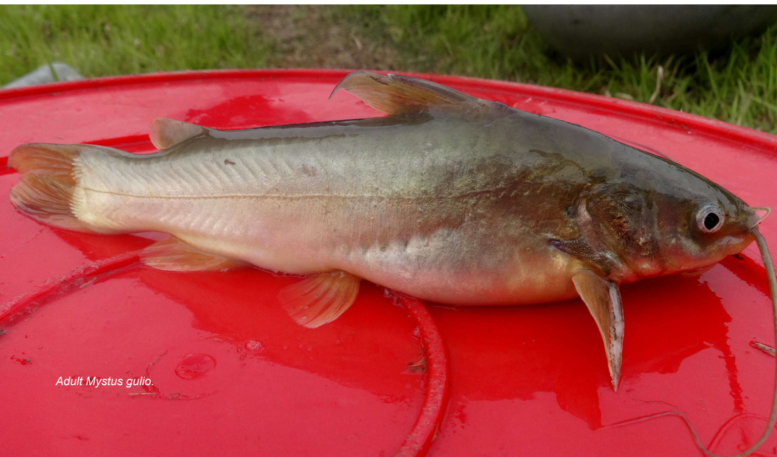
Adult Mystus gulio .

Smaller sized earthen ponds (500-1,000 m 2 ) are ideal for maintaining the broodstock of M. gulio . Broodstock need to be fed at the rate of 5% of body weight twice daily with supplementary feed (25% protein, 8% lipid). One month before the onset of spawning season (April-August), broodstock are fed once daily with chicken liver to satiation.