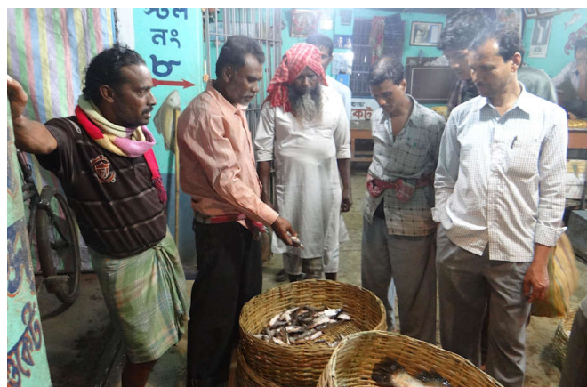
Marketing of Mystus gulio in Nischintpur, West Bengal.