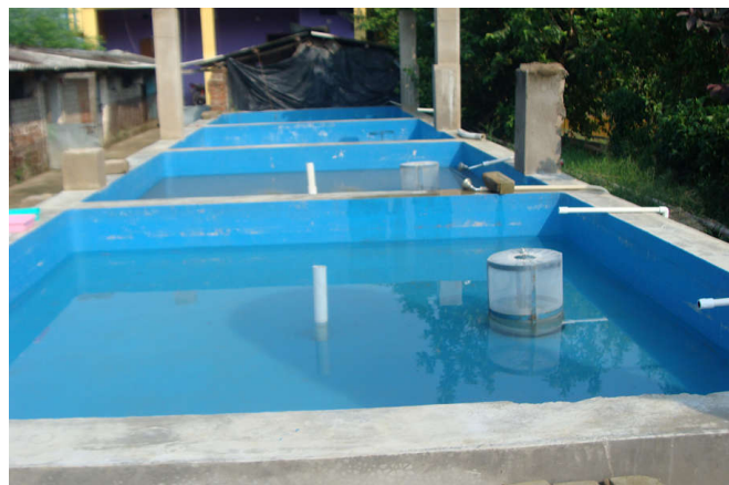
Multiple use of cemented tank for large-scale egg incubation for hatching followed by seed rearing.

An improvised hatchery system has also been developed at ICAR-CIFA, Bhubaneswar, for large-scale hatching, which is in use by farmers. The system consists of a circular FRP tank with inlets in the form of a duck mouth at the bottom of the tank, fixed at 45°. This system can accommodate about 50,000 fertilised eggs in a single operation with 60-80% hatching rate. The fertilised eggs are uniformly spread in the plastic tubs/circular container and a feeble current of water is provided to maintain optimum oxygen level. Some farmers also make use of the plant Ichornia crasipe , whose roots hold the fertilised eggs, and float them in the water tub till hatching. The hatchlings along with egg shells and broken roots are found in the bottom of the tank. It is difficult to separate them and long exposure in this environment leads to mortality of the tiny and tender hatchlings, a problem that is considered the main demerit of this system. The ideal temperature for hatching is between 27-30°C and hatching takes place within