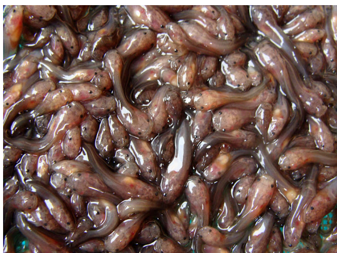
Two-week old magur fry.