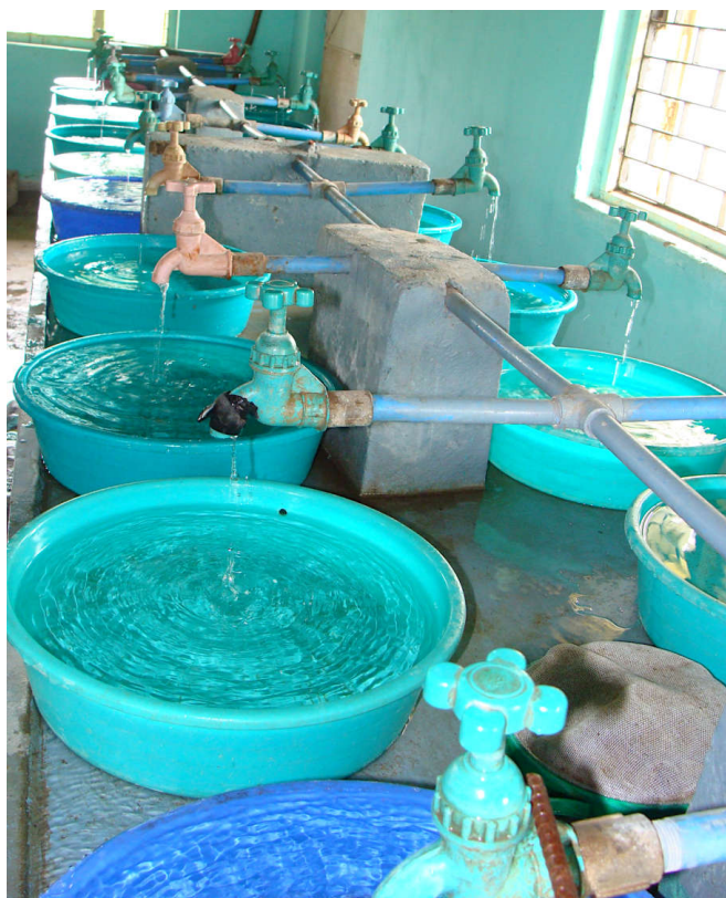
Incubation of eggs.

Larvae being small and delicate require a good aquatic environment for survival and the depth of water in an indoor-rearing system plays a major role for optimum survivability. To optimise survivability, water management is an important aspect during rearing. Aerial respiration commences after 10-11 days and hence, aeration must be provided to the larval rearing tank. Accumulation of metabolites and unconsumed feed in the rearing containers pollute the environment and ultimately lead to oxygen depletion, disease and mortality. Therefore, it is advisable to replenish 70-80% of water on a daily basis to maintain 10-15 cm water depth.