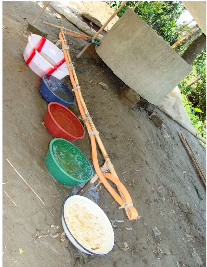
Back-yard flow-through hatchery made by a farmer for small-scale seed production.

Maintenance of healthy brood fish is a prerequisite for successful seed production in captivity. Usually, this species attains maturity in one year and both sexes can be employed for breeding on reaching 100-150 g. It is always better to rear the brood fish in earthen ponds. As the water table goes up during monsoon months, collection of the catfish for breeding attempts becomes difficult in ponds. Hence it is better to collect the broodstock from culture ponds during the pre-monsoon month and rear them at 2-3 fish/m 2 in cemented tanks. The tank bottom may be provided with soil of 2-3 cm thickness to prevent injury when fish move along the bottom. The tank must bear inlets and outlets at the desired level for managing water level, with a complete drainage facility. These facilities are used to manage water quality or to drain for collection of entire stock. Continuous flow of water (two litres/minute) for a few hours is necessary during sunny days to avoid excessive water temperature, reducing the chance of stress in broodstock. A mixture of fish meal, groundnut oilcake, soybean meal and rice bran with vitamin and minerals, resulting in 30% protein level at 2-3% of the body weight, is fed to the stocked fishes. The tanks are replenished with water at fortnightly intervals to maintain hygiene. Many farmers also rear fish with feeding in small ponds and collect before induced breeding without transferring to cement tanks.