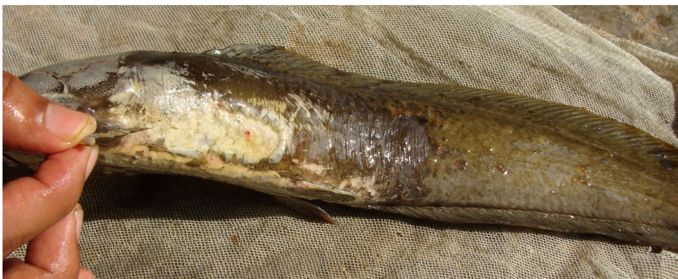
Bacterial infection in C. magur adult.

It is possible for advanced breeding of this species prior to breeding season. The hormone treatment is given to the fish in the form of sustained hormone pellets, which are implanted