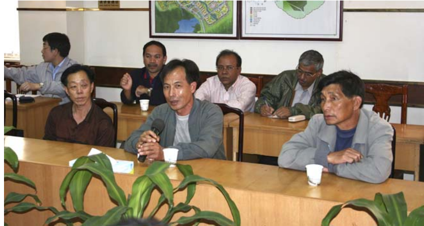
Above: Workshop participants met farmers from Nan Hu village (front row) to discuss issues in mariculture development, followed by discussions on the state of the trade with traders and managers from the Guangzhou Huangsha Seafood Market (below).

FAO and NACA are working together on editing of all the workshop papers. The objective is to publish the programme and workshop report in good time for presentation at the COFI Aquaculture Sub-Committee Meeting to be hosted by the Government of India in New Dehli during September 2006. The background to the workshop and presentations are available on the NACA web site.