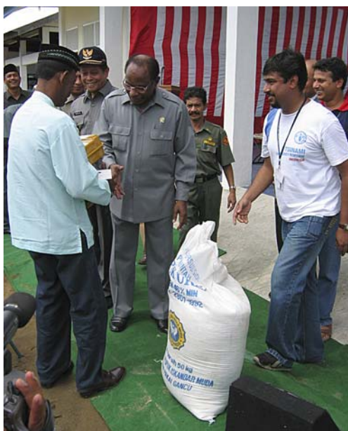
Indonesian Minister of Marine Affairs and Fisheries Freddy Numberi hands over a water pump to a tsunami affected farmer from Pidie district, Aceh. On right is Arun Padiyar.

Aceh - some 650 aquaculture farmers are rehabilitating their fish/shrimp ponds, known locally as tambaks and will fully resume farming by June 2006 with FAO assistance.