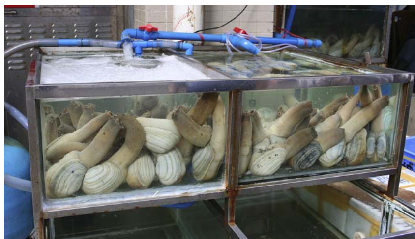
Above: Geoducks. More than 500 tonnes of seafood are sold at the Guangzhou Central Huangsha Seafood Trading Market each day, with an annual turnover of US$ 1 billion.