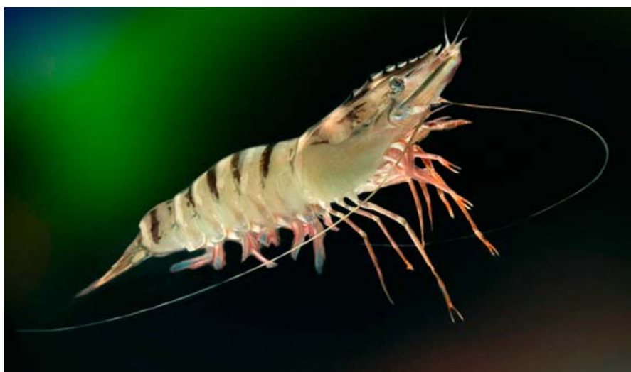
The new prawn is producing record farm yields which are leading to increased supplies of top quality, sustainably produced seafood

"Not only have we achieved national and international yield records with no reduction in quality or taste, these prawns are grown in a specially designed, environmentally sustainable