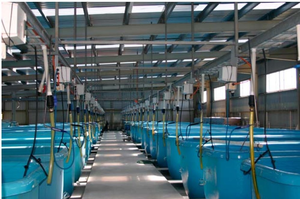
Specially designed tanks at Gold Coast Marine Aquaculture that house black tiger prawn breeding stock.