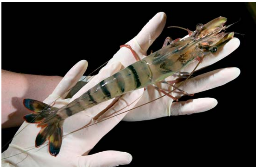
The Australian average industry productivity for farmed prawns is five tonnes per hectare. The new prawns produced an average of 12.8 tonnes per hectare in 2009.

Marine Aquaculture, has this year achieved average yields of 17.5 tonnes per hectare – more than double the