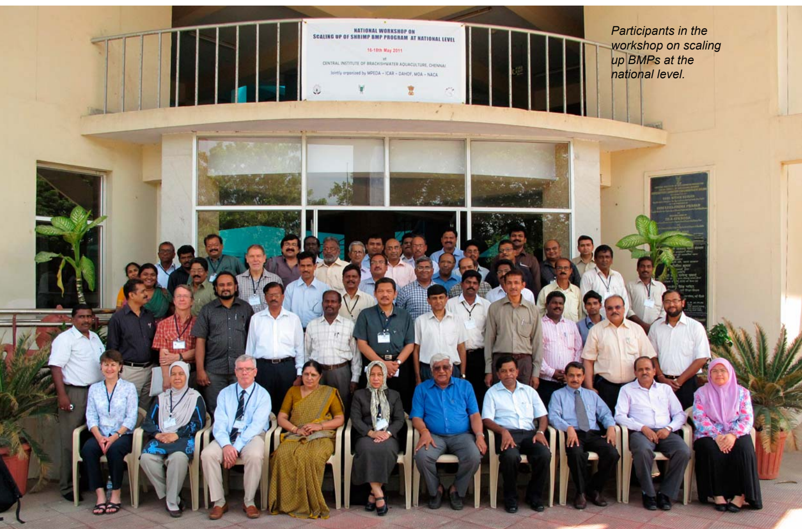
Participants in the workshop on scaling up BMPs at the national level.

The workshop brought together key stakeholders from all over India. These included representatives from MPEDA/NaCSA, ICAR (CIBA, CIFA, CMFRI), state fisheries departments, NFDB, CAA, fisheries colleges of state agricultural universities, farmer leaders, hatchery operators and processors, certification and standard setting bodies. In addition, experts from various regional and international organisations (e.g. NACA, FAO, WFC, INFOFISH)