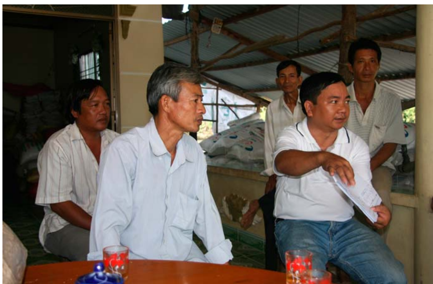
Project team discussing BMP implementation with a farmer cluster.

The project held a workshop to discuss BMP implementation in Can Tho, Vietnam, on 16 April 2011. The workshop was attended by 60 farmers and officials from the four participating provinces of An Giang, Don Thap, Vinh Long and Can Tho and organised by Can Tho University. Discussions centred around the formation of collaborative groups to implement BMPs, mechanisms for group operation and governance, requirements for record keeping and standard operating procedures and arrangements for evaluation.