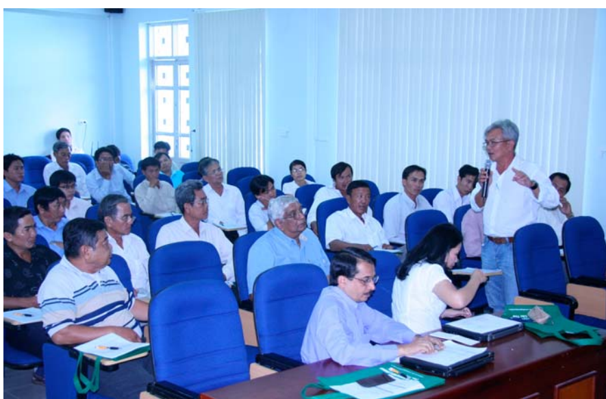
Workshop with Vietnamese catfish farmers on better management practices and cluster formation.

Eleven collaborative farmer groups were agreed to be established by participants, each of which consists of farmers whose properties are clustered within a small geographic area and share a common water supply. Eight of the groups are engaged in catfish growout and three are nurseries that produce fingerlings for sale to growout farms. Each group selected a Chair and Vice-chair and agreed on standard operating procedures and governance arrangements, including the development of crop and water calendars, organisation of meetings, record keeping and liaison with input suppliers and processors.