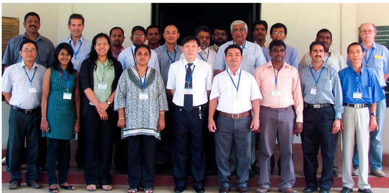
Participants in the 2nd Aquaclimate project meeting.

available for available for download. For more information, please see the Aquaclimate project webpage.