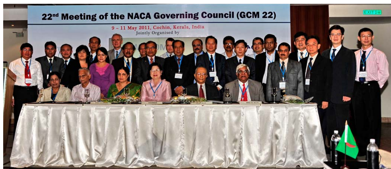
Delegates and staff participating in the 22nd NACA Governing Council Meeting.