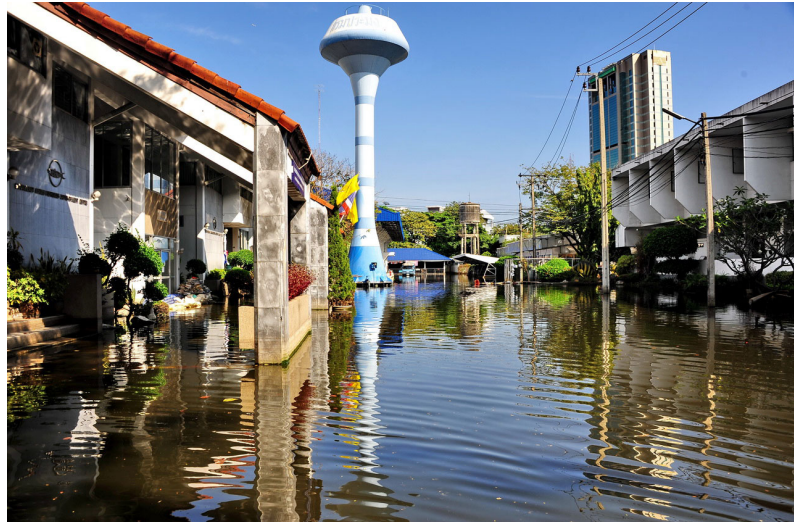
Floodwaters inundate the Department of Fisheries compound.

Finally the water was low enough to get back to the office and the clean-up began. Fortunately we had moved nearly everything upstairs in advance of the flooding, so damage to the Secretariat was minimal (if only we could say the same about houses). It will take a while longer to clear the backlog of email and to get things back to normal, but we are getting there and hope you will bear with us a bit longer.