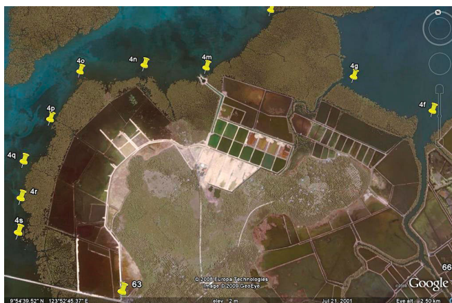
Green water shrimp farms, associated to mangrove forest, on Bohol in the Philippines.

farmers in the Mekong Delta. For a cleansing function the area of mangrove should be 4 to 22 times larger than the shrimp pond areas, which is rarely the case.