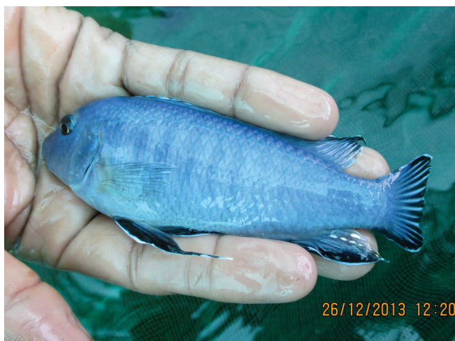
Male blue eyes brooder.

Blue eyes have a pinkish-grey body colour with yellow extending from the underside of the mouth through the throat and into the belly. They have a fairly stocky, deep body, with a short, gently sloping forehead ending in a small, pointed, terminal mouth. Also have seven or eight vertical black stripes, often faint in males, on the body. More pronounced are the black spots midway on the body that start just behind the gills and run the length of the body to the tail. A band running from the eye to the corner of the mouth is often present. The dorsal fin has light aqua streaks through it and is tinged light maroon or vivid red colour. The caudal fin is spangled blue close to the caudal peduncle, less towards the