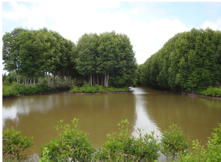
Integrated shrimp / mangrove farm.