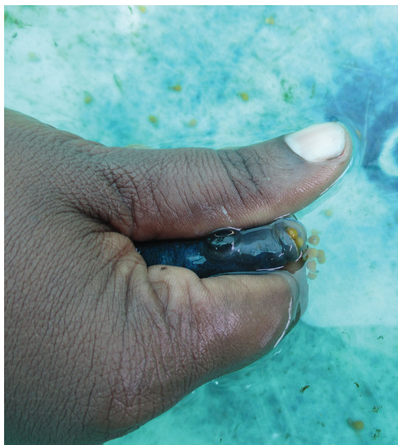
Releasing the yolk sac larvae from a blue eyes brooder.

The spawning tank should be provided with small flower pots kept in such a way that it could not roll, laid on its side. Before breeding, the pair engage in body quivering and tail slapping, after these, they start cleaning the flower pot and then start to spawn in it. The female starts laying its eggs on a vertical surface. Usually, it may lay 100–250 eggs. After releasing the eggs both parents may clean off dust particles and any detritus that deposit on the eggs and aerate them using their fins. The eggs hatch after 65–72 hours of incubation. When the eggs have hatched, the fry will feed from their egg sacs and stay closely together to the side of the wall. The fry will