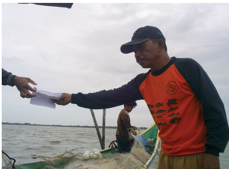
The fisheries officer (above) is checking an outsiders or "andon" fishers (seen below) fishing permit in the coastal Berau.

Fishers organise their livelihoods using their knowledge of tidal and seasonal variations, making use of the lunar calendar to plan their fishing trips. Within one month trammel netters effectively fish for 20 days. In the good fishing season with northerly winds (October-March) trammel-net fishers