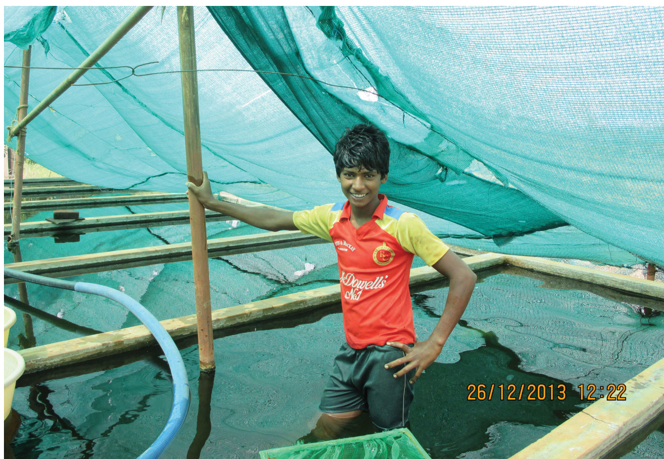
The boy working in the farm standing in the blue eyes brooders tank.

faeces and the presence of “hole in the head”. The symptoms of this disease are often confused with similar symptoms of nutritional deficiencies. The disease is treated with common aquarium anti-parasitic agents. Lymphocystis disease is a viral disease. Treatment is difficult and affected fishes should be separated. Dropsy or kidney bloat is a disease caused by one of several gram negative bacteria commonly present in aquarium habitats. As the infection progresses, skin lesions develop, the belly fills with fluids and becomes swollen, internal organs are damaged, and ultimately the fish will die. The disease is difficult to cure but salt treatment may be useful in the initial stages.