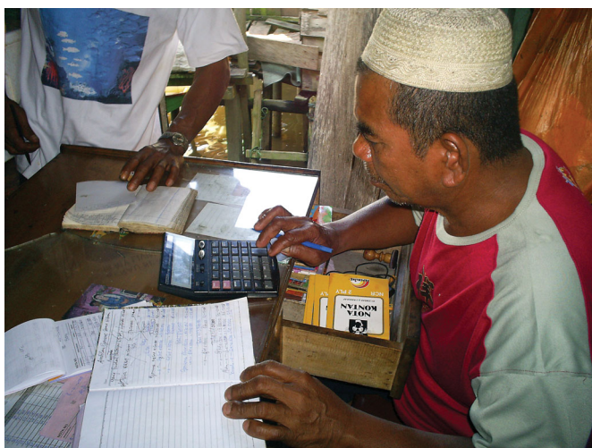
A local patron or punggawa.

Historically, the indigenous Dayak people of eastern Kalimantan did not live on the coast. Buginese fishers from southern Sulawesi (Celebes) have migrated to and settled in these coastal areas from the 19th century onwards, and many are still coming in today search of a better livelihood. In the 1980s the Indonesian government's transmigration program moved people from Java and Bali to settle in the lowland areas of East Kalimantan. Consequently, two-thirds of Berau's present population immigrated after 1995. Access to fish and shrimp ponds are often facilitated by patrons or bosses (punggawa) who are land owning shrimp traders or entrepreneurs with strong financial capabilities and political networks. Their patronage networks extend well beyond Berau to Tarakan and Sulawesi. Successful shrimp farmers or traders can develop their own political-economic network and become a punggawa. The economic, social, political, and religious relationships between a patron and the pond farmers are a fundamental condition to practice extensive pond (tambak) aquaculture in Berau, like elsewhere in East Kalimantan. The patrons provide land, assist in creating the pond and provide the first capital; in return, all harvest passes through their local and global trade network (Gunawan and Visser, 2012; Kusumawati et al., 2013).