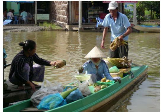
Above, below: Small traders, Vietnam.