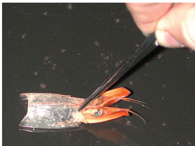
Clinical signs of WSSV.

Our study used the genome of WSSV-isolate TH (having 292,967 base pairs) as a reference (Van Hulst et al., 2001). The Vietnamese WSSV was characterised by two major deletions found in the open reading frames ORF-14/15 (Indel-I) and ORF-23/24 (Indel-II) and three regions with variable numbers of tandemly repeated sequences (VNTRs) located in ORF-75, ORF-94 and ORF-125 (Dieu et al., 2004). We used both the Indel and VNTR regions for characterising WSSV at the local and regional level and found more variation in