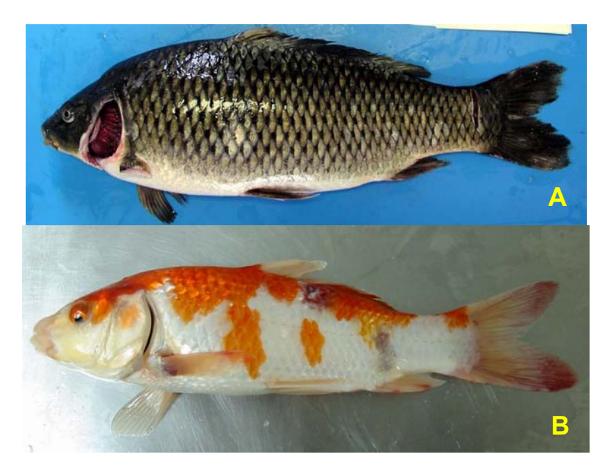
Figure 1. Examples of carp at the early stages of infection with KHV. A: Common carp with no marked signs of disease apart from a small degree of fin rot and slight redness of abdomen. B: Koi carp with skin haemorrhages, congested fin and sunken eye, diagnosed positive for KHV by PCR.