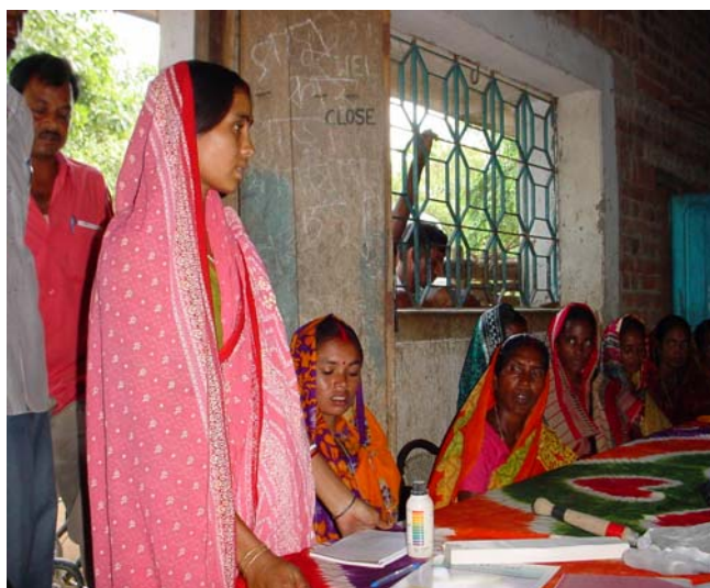
Federation general body meeting