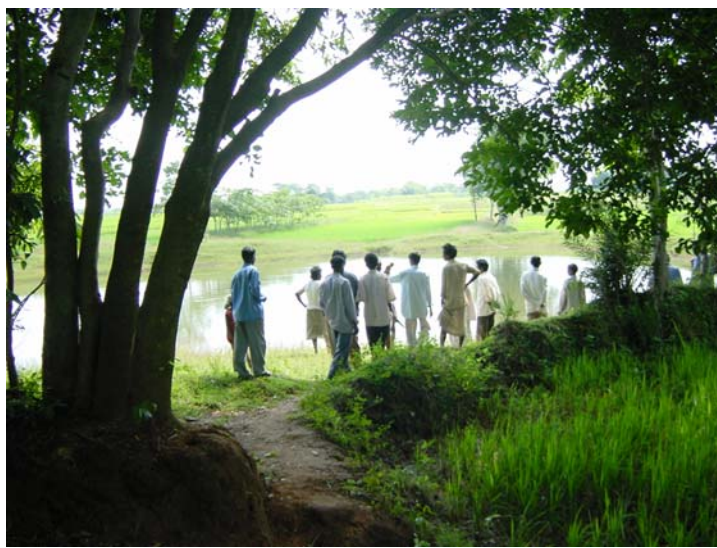
Nursery tank stakeholders, Kaipara

Although fish is popular and nutritious, fish culture is known to be successful and an important contribution to food security, a range of factors still influence the opportunity to use water resources (especially tanks) successfully for aquaculture. These can often involve a wide range of stakeholders.