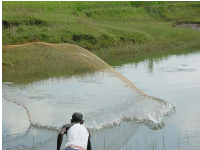
Cast netting in Kaipara nursery pond

We all make decisions in our own lives, based on our own circumstances, and each one of us have different sets of criteria and reasons for the choices we make. However, there are three consistent and powerful reasons why fish culture is a popular livelihood option in rural areas of West Bengal and neighboring states. The first is that people who are food producers have greater food security than those who have to purchase it. Everyone in Kaipara is aware of the sometimes painful, practical steps that individuals and families need to take to secure enough food, through dadan or migration, or other means.