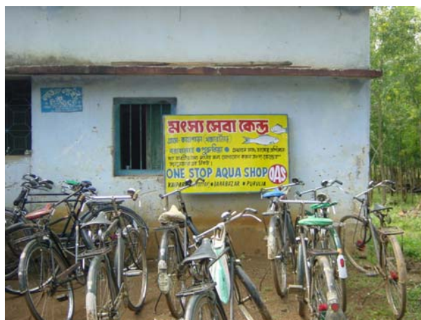
Kaipara One-Stop Aqua Shop

To start it off in 2004, two tanks have been leased by the federation for nursing fish fry. These have so far supplied about 25,000 fingerlings to farmers in a 3-km radius, with discounted rates offered to federation members. People are already coming to buy fingerlings from up to 24 km away but the federation is cautious about promising what it can supply. “The emphasis is on building a reputation for quality,” says Kuddus. The federation estimates that the local market for fingerlings is 1,000,000, and their first aim is to develop the OAS capacity to supply half this total.