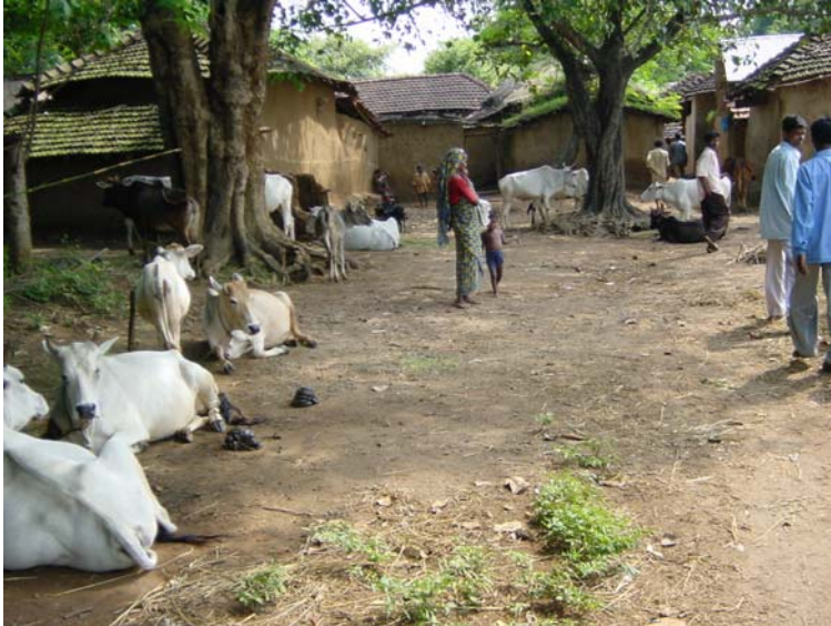
Kaipara Village, West Bengal

disease damage to crops are frequent, and occasionally serious, occurrences. For example, a brinjal and tomato viral disease in successive years has reduced farmer motivation to invest in these crops. In the staple paddy crop, leaf burning has become a major disease during recent years, while stem borers in paddy and pod borers in pigeon pea are common problems every year.