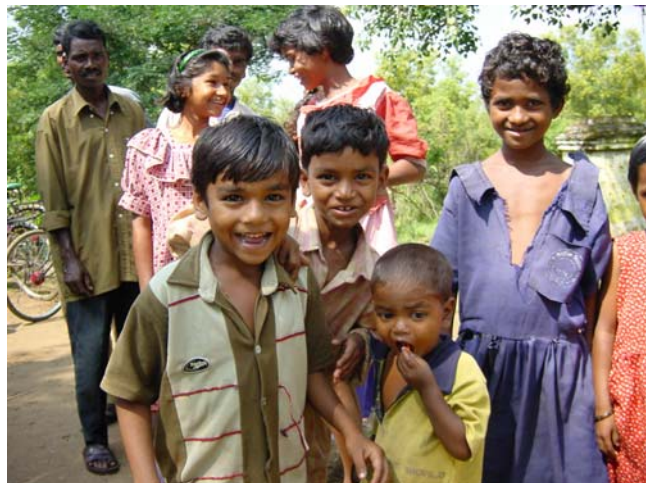
In Kaipara village, West Bengal

About 1,200 people live in Kaipara in nearly 200 households, while another 80 households live in the neighbouring hamlets (or tolas ) at Khamar Tanr and Gunsaipua Tola. The population is made up of a number of different ethnic groups including Mahatos 1 , the Scheduled Tribe Oroan, and the Scheduled Castes Ruhidas, Sahis and Kalindi.