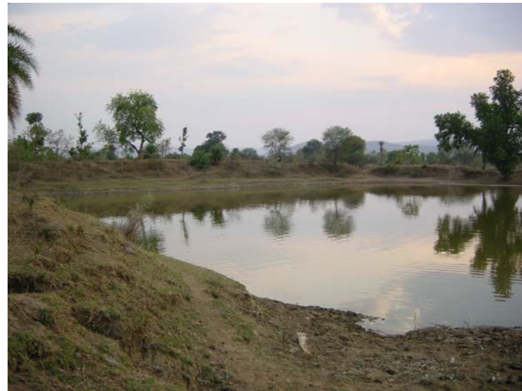
A munda typical of those seen in Orissa. This munda in Kumna block Nuapara is used for fish culture.

There are lots of things to think about before finally recommending a site. Think about getting to the pond (maybe with a vehicle): make sure this is easy. Avoid tall trees that block the sunlight or drop leaves. Avoid swampy, marshy or peat soils and try to avoid places that flood frequently. Think about how to stop poaching. Near towns, avoid neighborhood factories that give out gases, smoke, fly-ash, or organic or toxic outflows.