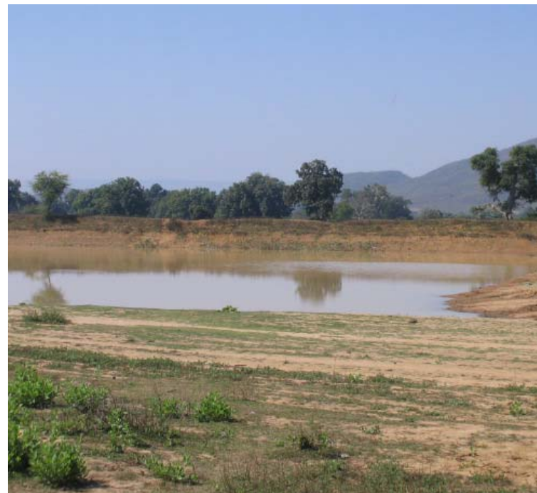
A kattah typical of those seen in Orissa. The kattah is a good place for fish production.

Dugout ponds are usually dug in low-lying saucer-shaped areas that are surrounded by a dyke. These are usually dug for water storage rather than aquaculture but can be used for fish culture if a proper site is selected.