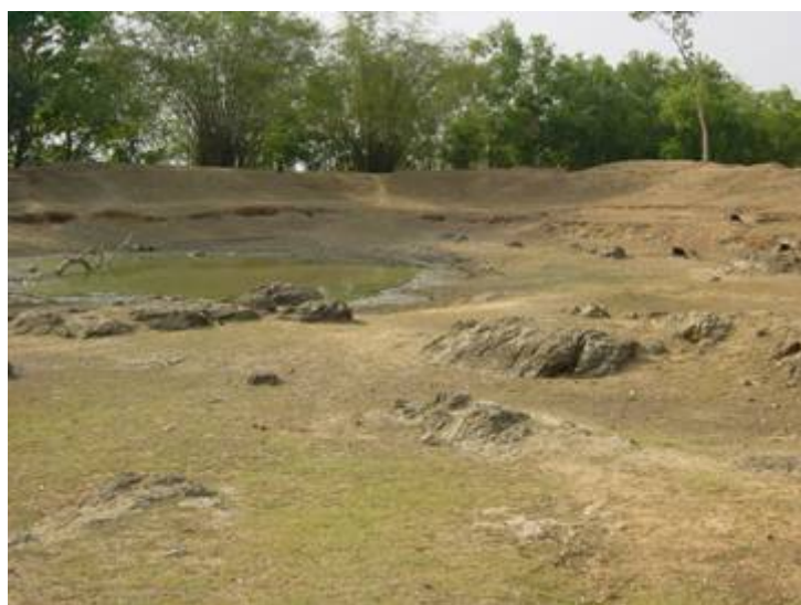
Huchak Guria in Jabarra Village, being dewatered for deepening and improvement