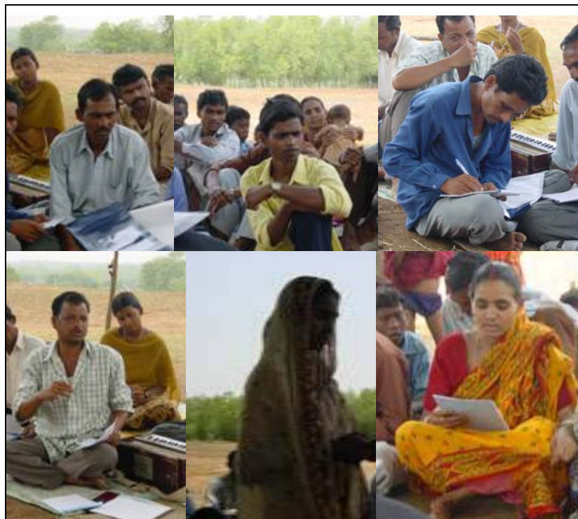
People tell their significant change stories at the Kaipara workshop

Significant change stories were written in Bengali by nine of the participants (Appendix 5), of which seven were read out during the workshop itself. STREAM colleagues asked questions about the particulars of the stories, especially those which related to how people perceived the changes they expressed.