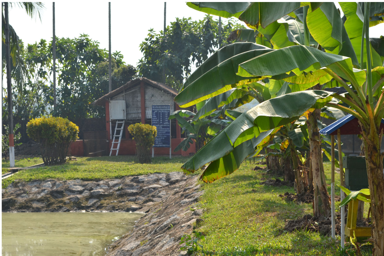
A model integrated livestock fish crop farm.

1. Fisheries Research Centre, Assam Agricultural University, Jorhat, Assam, India - 785013; 2. Krishi Vigyan Kendra, AAU, Nalbari, Assam, India - 781337. Email: sonamoina.cife@gmail.com.