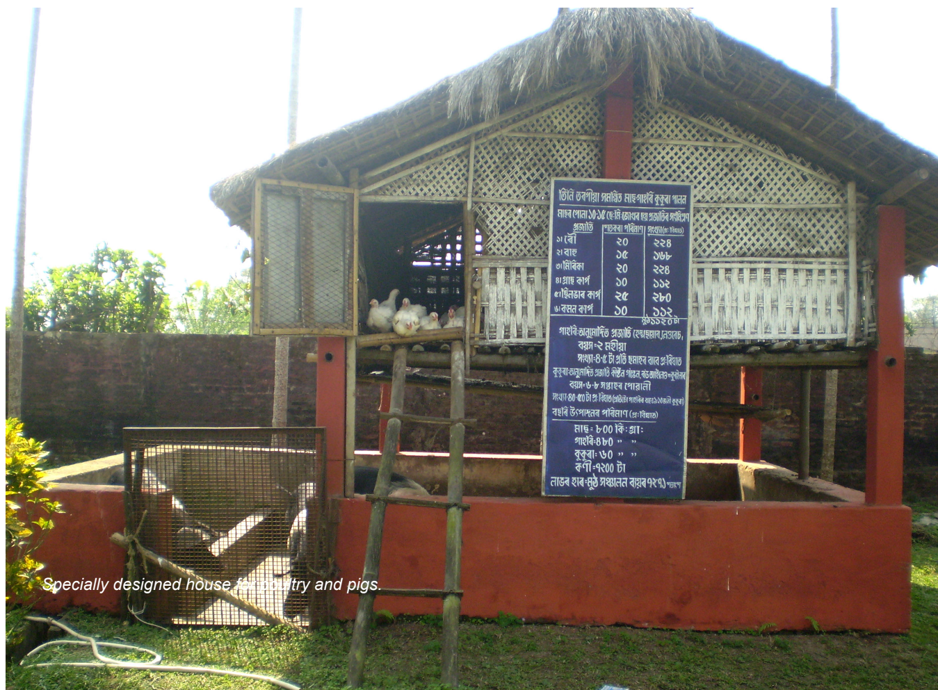
Specially designed house for poultry and pigs.

Six species were used in semi-intensive carp farming i.e. rohu, catla, mrigal, common carp, grass carp and silver carp following the standard package of practices for pig-fish farming. Ponds were stocked with carry over seed (yearlings) at a density of 8,000/ha. No extraneous supply of feed or manure was used except for grass carp feed in the form of aquatic or terrestrial vegetation. Stocking rates of pigs were kept at 40/ha and 10 birds (layers or broilers) per pig to supplement around 40% of pigs' daily feed requirement 2 . The ratio of chicken : pigs : fish was kept at 10 : 1 : 200 in this system. Every six months pigs attaining slaughter size were disposed of and new batches were procured. Water quality parameters were monitored and pH of water was regulated by interim application of lime. Desilting of the pond bottom, bottom raking as well as control of algal blooms as and when required was done by following standard methodology. The pond embankments, inter pond spaces and other free areas of the farm were used for crops such as banana, lemon, areca nuts and coconuts etc. Regular observation of health and weight gain of the livestock and fish was conducted. Data on total production of fish, pigs, poultry, horticultural crops, total investment revenue generated and net income were collected annually. Analysis of cash flow, calculation of percent profit over operational cost, benefit cost ratio, and