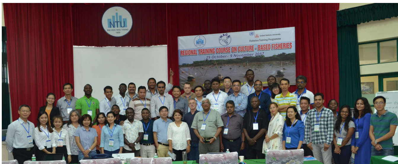
Participants and trainers, Nha Trang University, Vietnam.

There are many initiatives underway which are designed to increase food supply, employment and income opportunities in developing countries, most of which require considerable capital inputs. Often overlooked, are the opportunities to produce more food from the natural productivity of local ecosystems. Culture-based fisheries (CBF) are one example of a relatively simple and low cost technology that can deliver nutritional and economic benefits to rural communities, which often have few livelihood options.